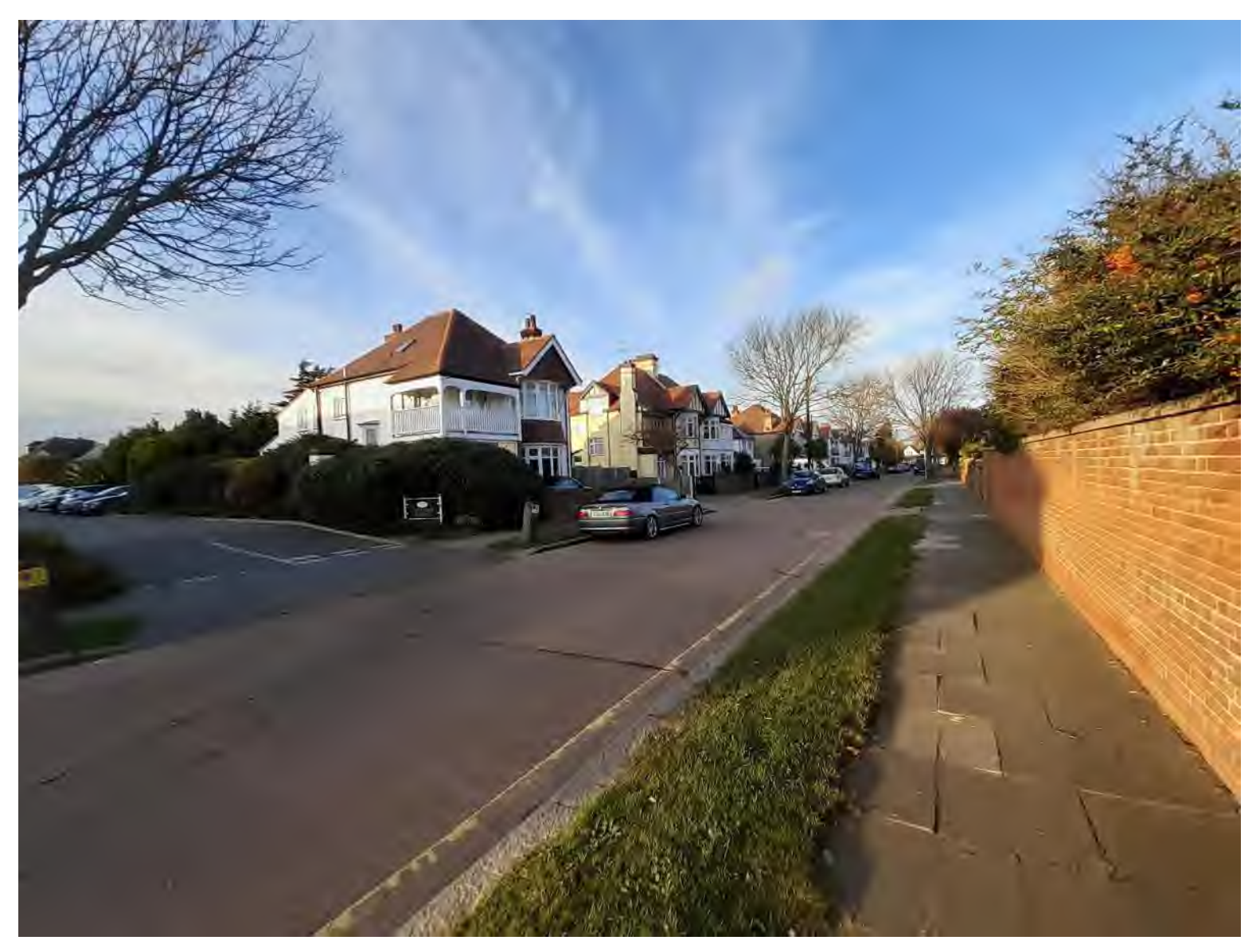
Neighbouring properties to the north of the site on Walton Road